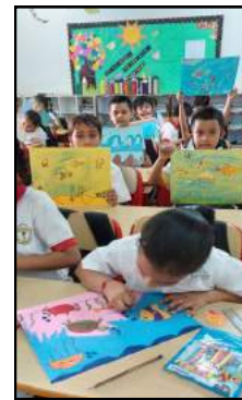
DRAWING AND COLOURING CLASS IV & V