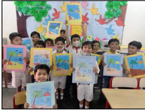
COLOUR THE PICTURE CLASS I