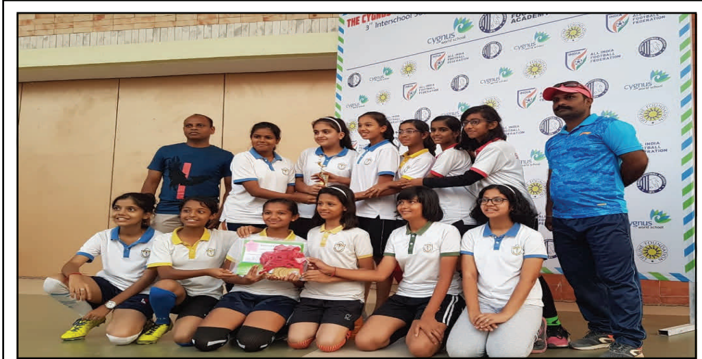
Girls team of DPS Harni under 14 category won the Final match against DPS Kalali held at Cygnus World School Football Tournament.