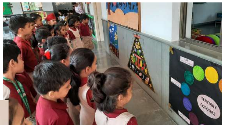
WALL OF LEARNING