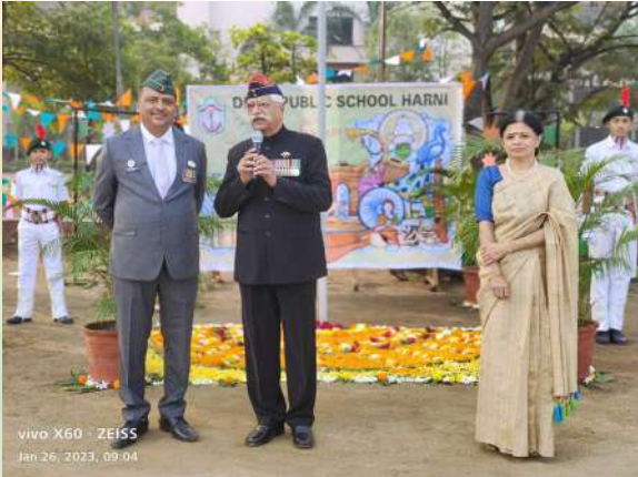
vivo X60 - ZEISS Jan 26, 2023, 09:04