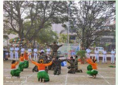
vivo X60 - ZEISS Jan 26, 2023, 09:40