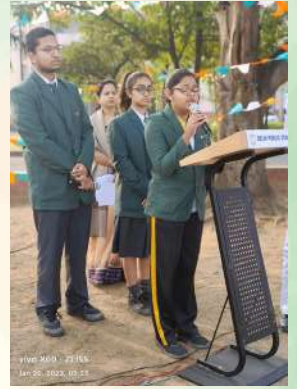
vivo X60 - ZEISS Jan 26, 2023, 09:03