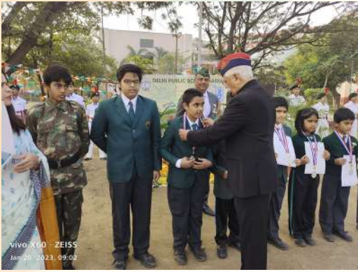
vivo X60 - ZEISS Jan 26, 2023, 09:02