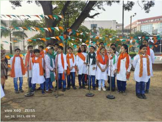
vivo X60 - ZEISS Jan 26, 2023, 09:19