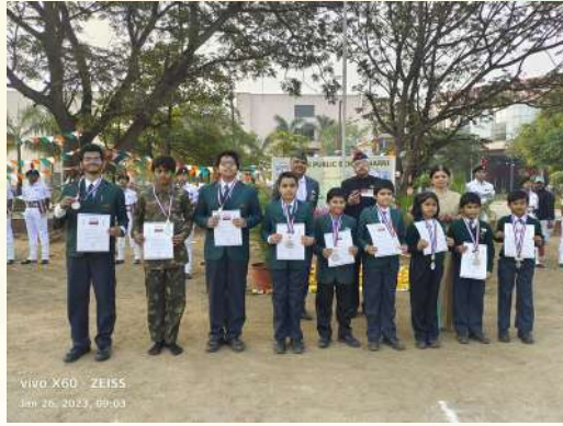
vivo X60 - ZEISS Jan 26, 2023, 09:03