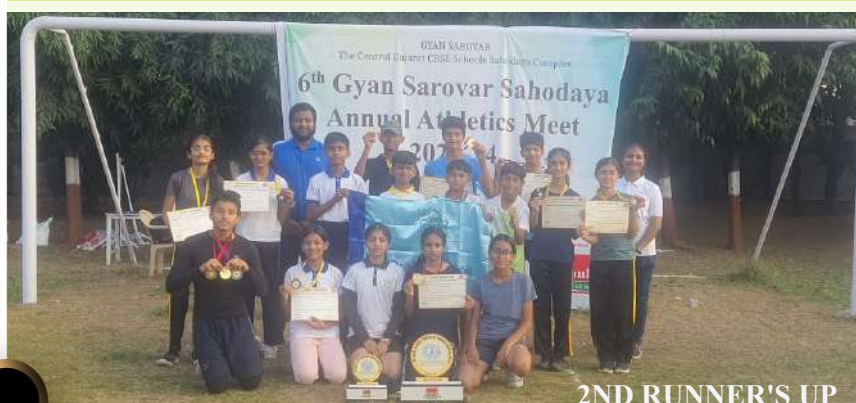
2ND RUNNER'S UP