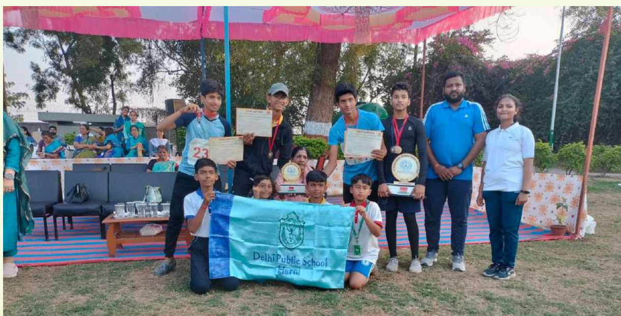
CHAMPIONS- BOYS CATEGORY